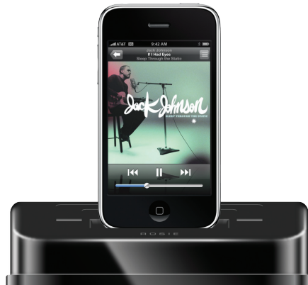
Savant Media Dock

SmartAudio can be paired with Savant Media Docks (in-wall or desktop) transforming an iPod or iPhone into a portable digital media server combining the convenience of personal audio with the performance, distribution and control capabilities of Savant multi-room A/V systems.