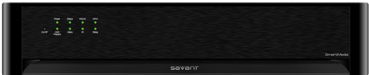
SmartAudio, Front and Rear View