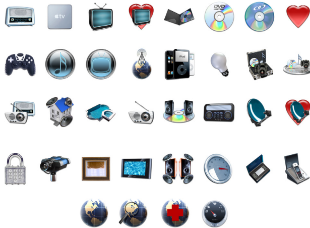
Library of Photo-realistic Service Icons

Configure and readily customize the Touch Surface interface using Savant's common design tool—RacePoint Blueprint™. With limitless flexibility and creativity, Savant empowers you to meet the stringent needs, personal preferences, and demands of your customers and installations.