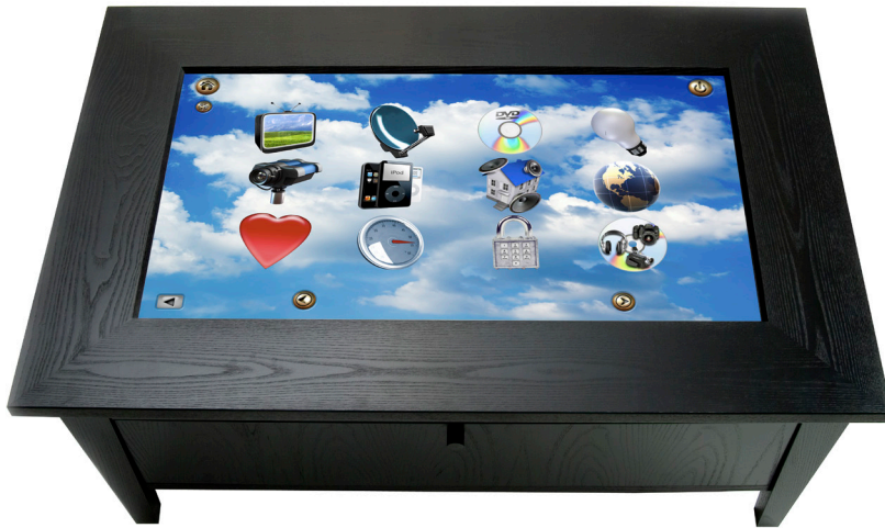
Figure 1: Touch Surface with photo-realistic floating service icons

The first Apple®-based surface product, the Touch Surface brings the converged functionality and capabilities of Savant's touch interfaces to a surface technology that is practical on the one hand, entertaining and exciting to use on the other. User-interactive multimedia features include integration and interaction with iTunes® multimedia content, digital games, and many more entertaining digital devices on the horizon.